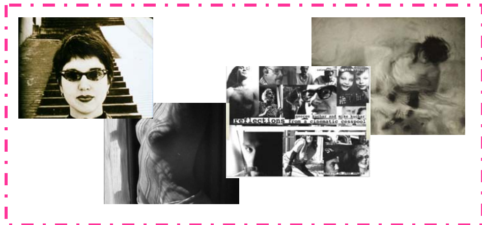
Stan Brakhage, Paranoia Corridor , (1995) 3 min

This mixture of love and hate, and the inventiveness of the mechanisms through which the paranoid person attempts to reestablish relations with the world have made paranoia a phenomenon that has interested artists and filmmakers: when the boundaries between self and world become shaky the imagination sometimes assumes a fascinatingly delirious quality. This program includes experimental films, made from 1920s to the present, whose makers have taken the mysterious processes of paranoia as a model for art making.