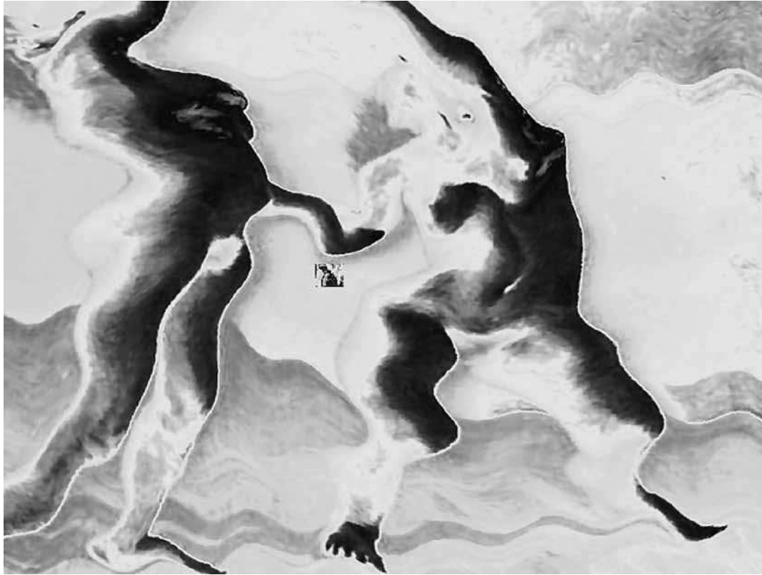
Bruce Elder, The Young Prince (2007), frame enlargement.

passage. This time, eroding the film material, does away with the interval between the (man-made) filming process and the (natural) chemical process that subverts and transforms the initial imprint. 19 Habib's insight can easily tap into Elder's "aesthetics of ruin," inasmuch as his images suggest the material traces of decay as the reminder of the process from their initial inscription on celluloid to its inevitable deterioration.